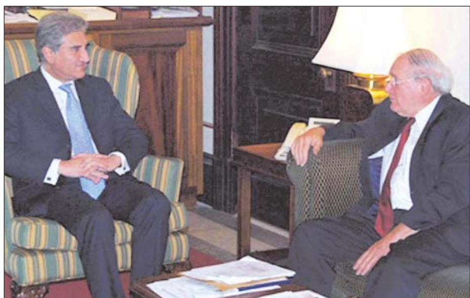
WASHINGTON: Foreign Minister Shah Mahmood Qureshi meets Senator Carl Levin, Chairman Senate Armed Services Committee.