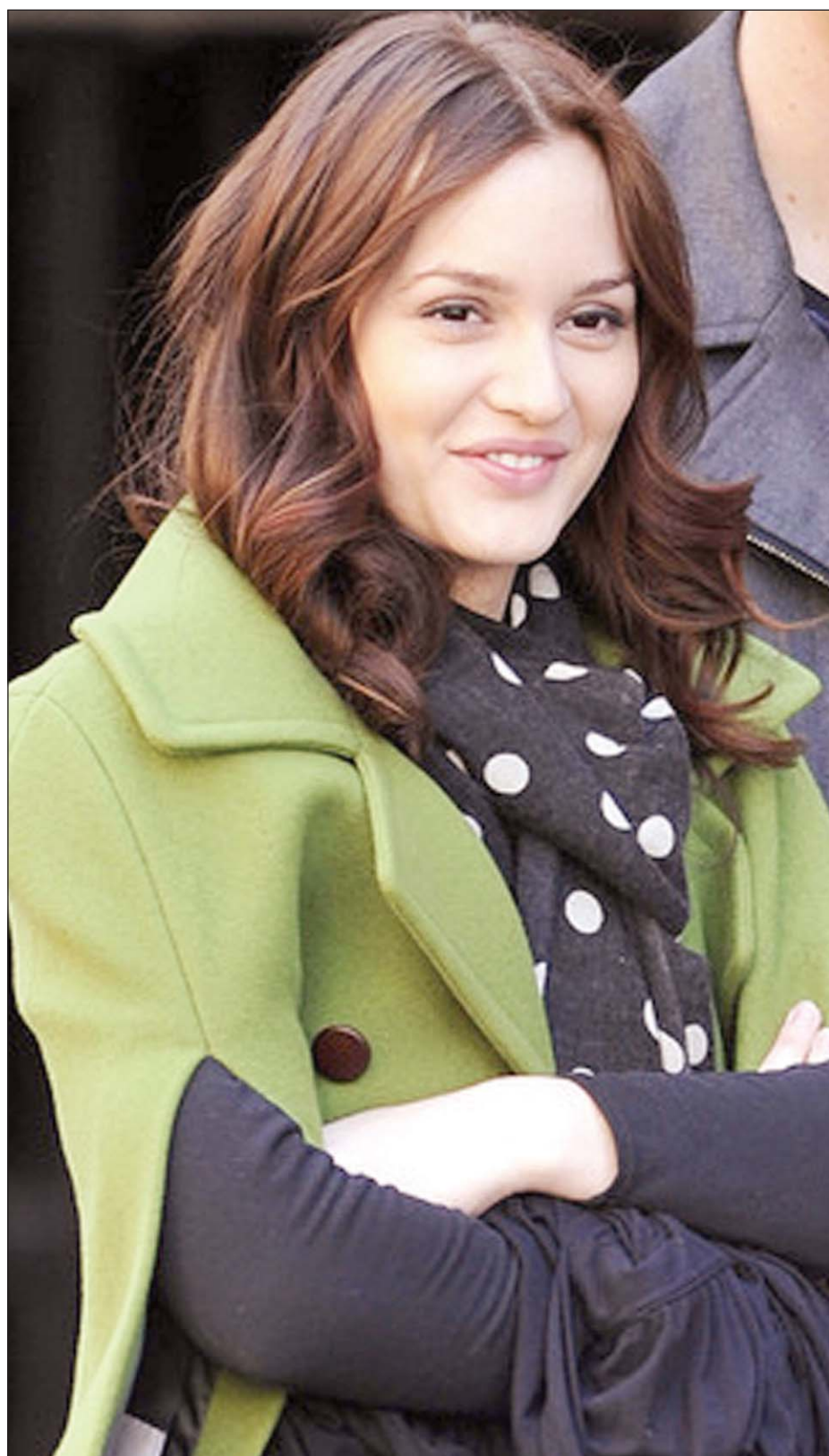
Leighton Meester, wearing a green, double breasted coat and polka dot scarf over a blue floral dress, hangs out on the Brooklyn set of "Gossip Girl". Connor Paolo, wearing headphones around his neck and talking on his cell phone, was also spotted on set.